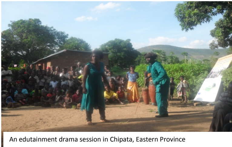
An edutainment drama session in Chipata, Eastern Province

Edutainment were conducted by incorporating gender and GBV awareness and prevention themes and information into the content of mass media programming such as popular television and radio soap operas. Drama performances were a popular edutainment medium among a broad cross-section of the community. During these performances sensitization messages through songs, dances and actions including question and answer sessions were passed on to the communities. Additionally, services such as on-site counselling, referrals, legal advice and satellite clinics were provided. Edutainment provided information to survivors about the severe and life-threatening consequences of GBV, sensitized and created awareness to the community on the available GBV services and how to access them.