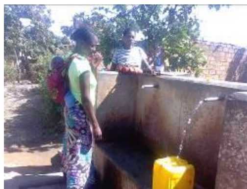
Water spillage at a Kiosk in Kalikiliki settlement.

Water vendors in Kalikiliki and Chibolya observed that taps are the one component of the system that wear out quickly. Households in Kalikiliki narrated how there is a lot of water wastage at the stands because of high pressure and that the wastewater is not being controlled and tends to be left to flow onto the road. They further explained that where a soak pit had been constructed, it is often left open posing a danger to children